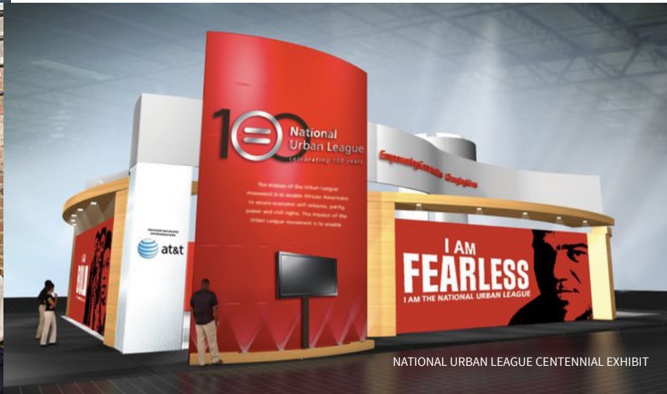
NATIONAL URBAN LEAGUE CENTENNIAL EXHIBIT